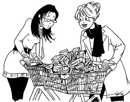
Yes, I have given up chocolate for Lent- all this is for afterwards!